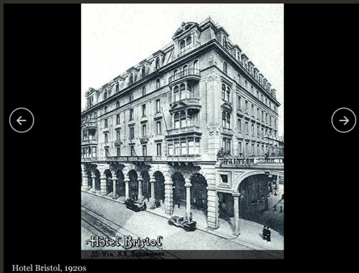
Hotel Bristol, 1920s