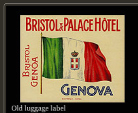
Old luggage label

Located on one of the most prestigious streets of Genoa - Via XX Settembre, Hotel Bristol Palace opened its doors in 1905. During the Belle Epoque the high society of Genoa chose it as the setting for sophisticated and legendary parties and an exclusive restaurant. Today this elegant Art Nouveau palace has been considered one of the most prestigious hotels in the city.